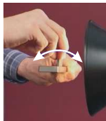
Figure 3. Visual inspection of scraper

If light is visible, the scraper is not suitable for use and should be replaced - see “Spares” on page 10.