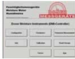
PC Software DMI-Controller