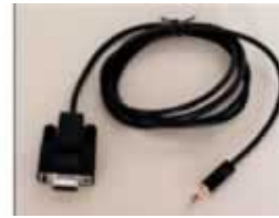
Serial Interface cable (RS232)