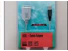
USB – R232 adapter