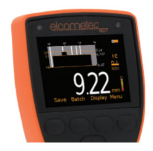
Cross Sectional 2D- B-Scan, ideal for relative depth analysis