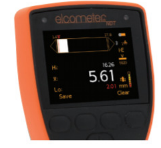
In scan mode the gauge takes readings at a rate of 16 Hz per second