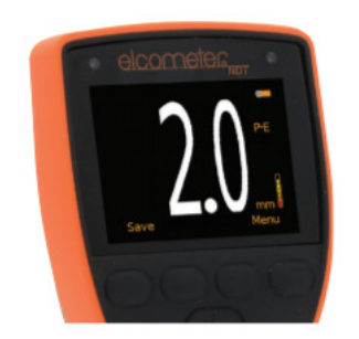
Large easy to read measurements

With a scratch and solvent resistant display, sealed, heavy duty and impact resistant design - dust and waterproof equivalent to IP54 - the MTG range is suitable for use in the harshest of environments.