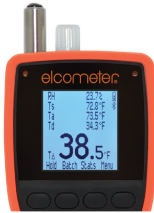
View up to 5 user selectable statistics on screen