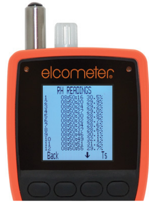
Review individual readings