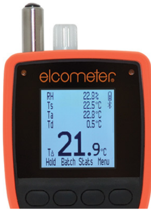
Large easy to read measurements in degrees °C or °F