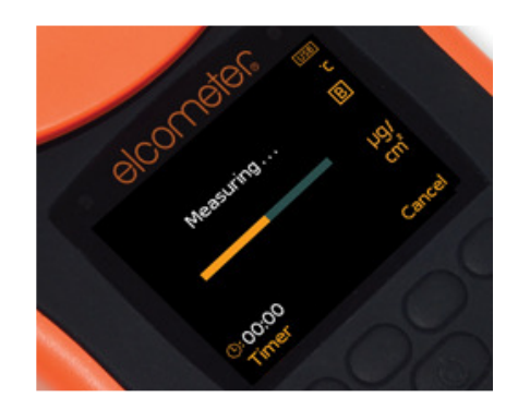
7. Close the lid, ensuring that the magnetic catch is fully engaged, the gauge will begin measuring.