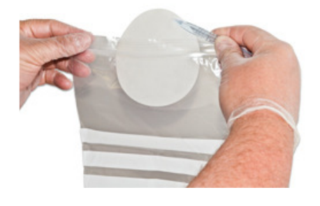
Place the filter paper in a resealable bag (supplied), if required for further analysis.