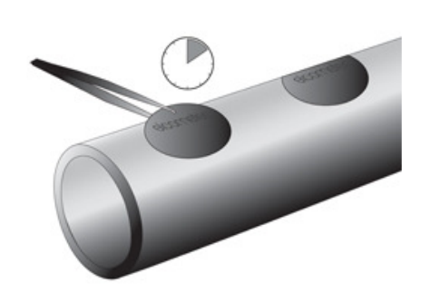
6. As each filter paper remains on the surface for two minutes, multiple tests can be undertaken at the same time, reducing inspection times further.