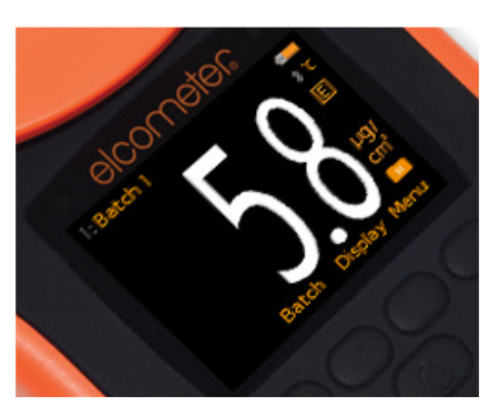
8. The reading will be displayed on screen in the chosen display mode.