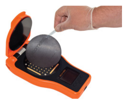
5. After two minutes, carefully remove the filter paper and magnetic disc from the test surface and place on to the measurement electrodes.