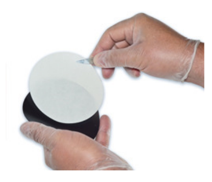
2. Using tweezers, remove a filter paper from the pack and place it on the cleaned, non-labelled side of the magnetic disc supplied.