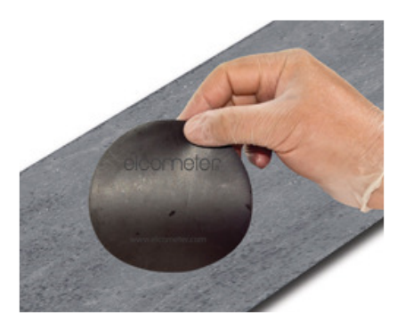
4. Place the magnetic disc, with wetted paper face down on to the area under test, pressing firmly into any contours or irregularities and start the 2-minute timer on the gauge.