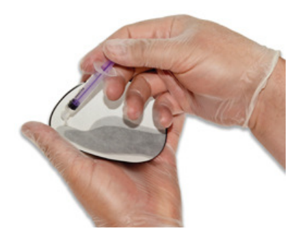
3. Disperse the water from the syringe, evenly across the whole of the filter paper and remove any bubbles from under the paper.