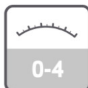
CM EQUIV CONCRETE READING RANGE