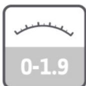
CM EQUIV ANHYDRITE READING RANGE