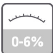
CONCRETE %MC READING RANGE